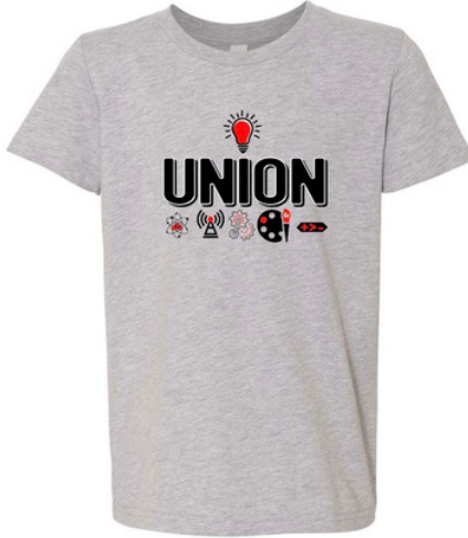
Bella Athletic Heather